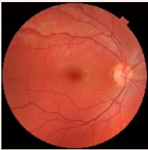
Colored Fundus Photography